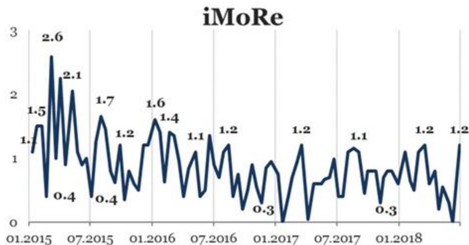
Chart 1. iMoRe dynamics

iMoRe can take values from -5 to +5 with value above +2 considered an acceptable pace of reforms