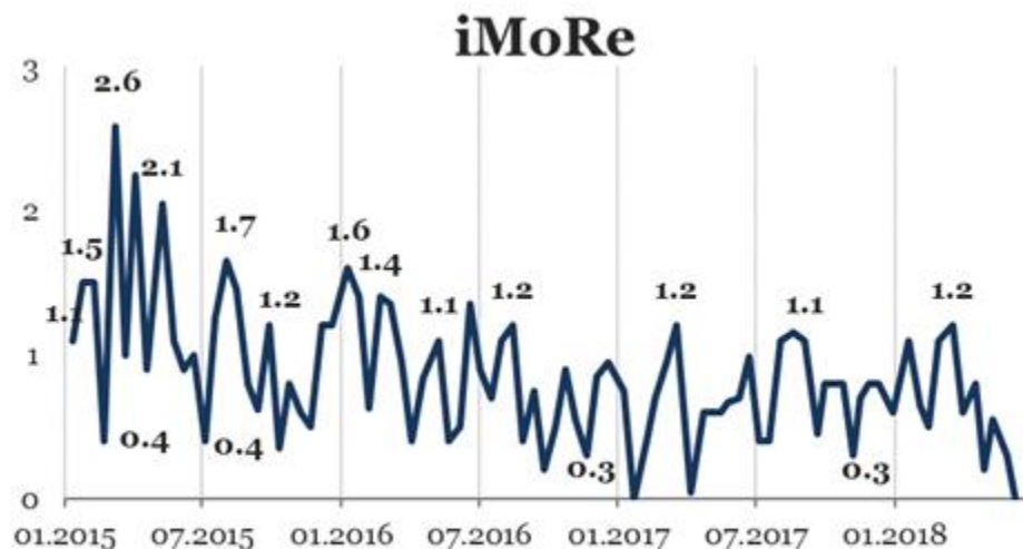
Chart 1. iMoRe dynamics

iMoRe can take values from -5 to +5 with value above +2 considered an acceptable pace of reforms